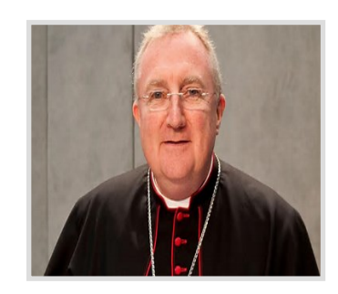
Confirmation St. Joseph's